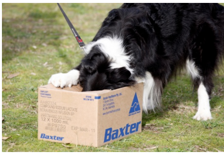
Simbah doing scent detection. Lucky he's not a bomb detector dog