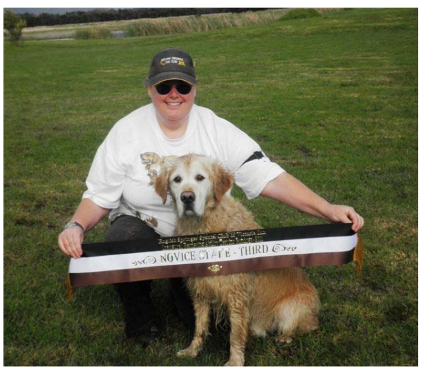
This is Mason's 10th VCA title and now has titles in 5 different disciplines (Confirmation, Obedience, Rally, Retrieving and Agility).